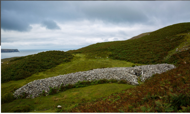
Left: St. Colmcille's Holy Well, Bíoán, Gleann Cholm Cille -one of the stops along Turas Cholm Cille observed between June 9 (St. Colmcille's Feast Day) and August 15 each year.