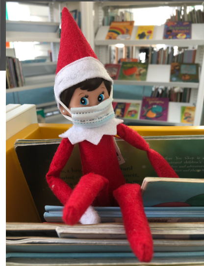
Our Elf on the 'Library' Shelf.

Not a member of the library? No problem. This service is for anyone who is in self isolation, whether you are a library member or not. You can join over the phone and your new library card will be included with your first delivery!