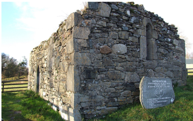
St. Colmille's Chapel in Gartan is an archaeological monument protected under the National Monuments Acts and will undergo conservation works in 2021.

St. Colmille, also known as St. Columba, is one of Ireland's patron saints, a distinction that he shares with St. Patrick and St. Bridget. St. Colmille was born in Gartan, County Donegal on December 7, 521 A.D. or 520 A.D. There are many sites associated with his life and many more that are dedicated to him. In 545 A.D., St. Colmille founded his first monastery in Derry / Doire Cholm Cille. St. Colmille and twelve monks sailed from Derry to the island of Iona in Scotland in 563 A.D. He died on Iona on June 9, 597 A.D. and his feast day is commemorated on that date every year.