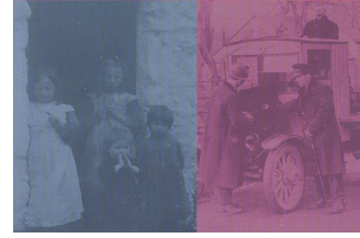
Left: Booklet "From Conflict to Division: Donegal 1919- 1925"

As part of the CINE project, cinecommunities.org has been developed. This website provides a series of 'getting started', guides for a range of digital tools which will enable communities to create and present engaging heritage content for indoor, outdoor and remote experiences. As part of the CINE project, the Museum and its partners worked with local communities to create virtual exhibitions as case studies in digital heritage. These include inchheritage.org and virtualstcatherines.net which showcase what is possible using the digital tools and platforms presented on cinecommunities.org .