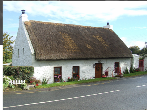
Left: Scollop-thatched, direct-entry cottage in Ballindrait